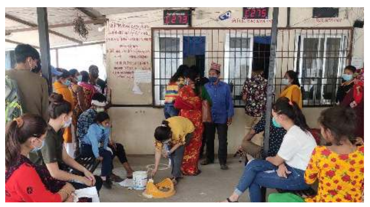
Provision of Social distancing at MBAHS, Hetauda Hospital by Department of Public Health