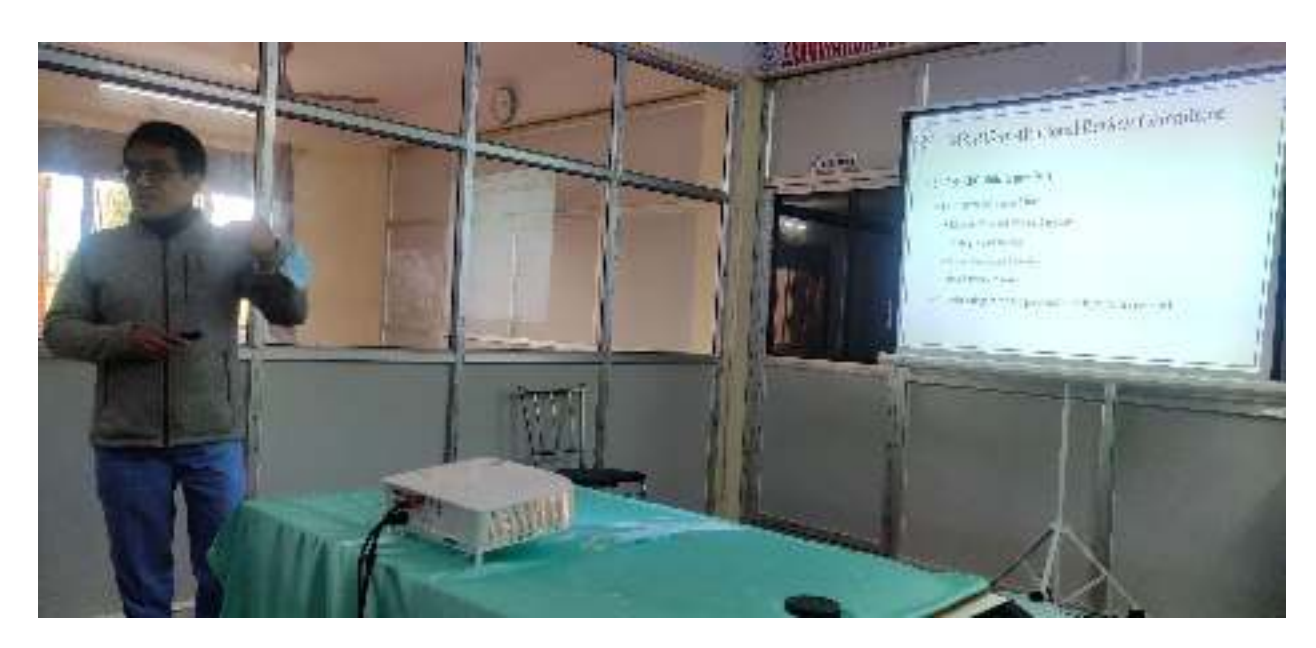
Presentation about MBAHS,IRC to ERB members of NHRC