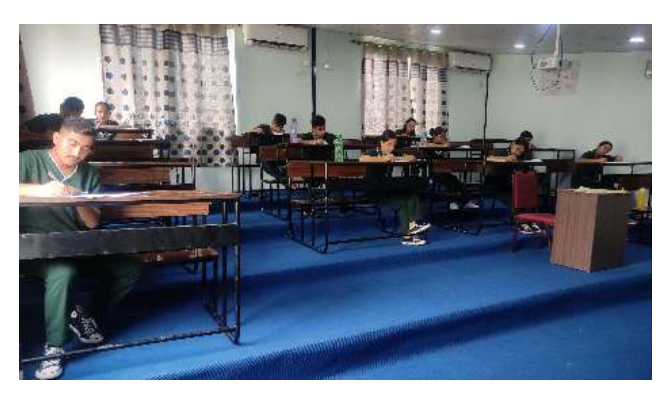
Students Appearing in the formative exam of MBAHS