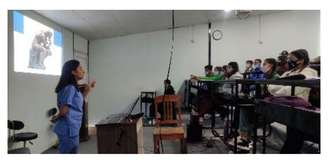
Workshop on Critical thinking