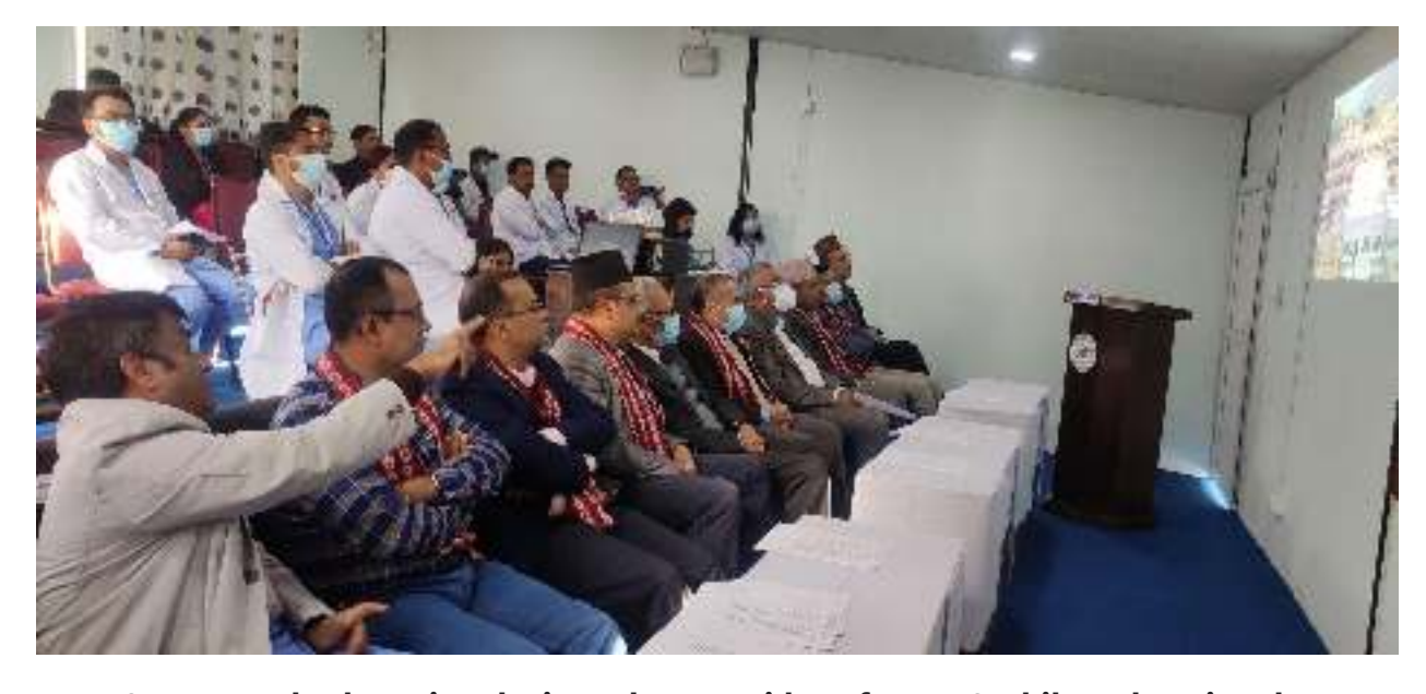
MEC personnels observing the introductory video of MBAHS while welcoming them.