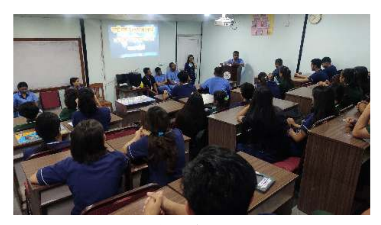
Exchange of best wishes during new year 2079 B.S.