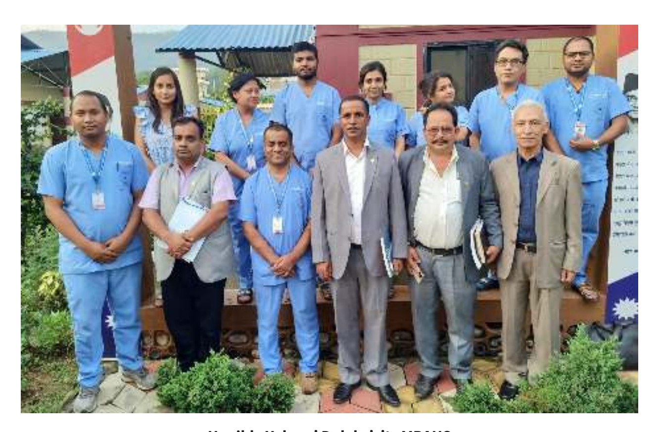
Hon'ble Yubaraj Dulal visits MBAHS