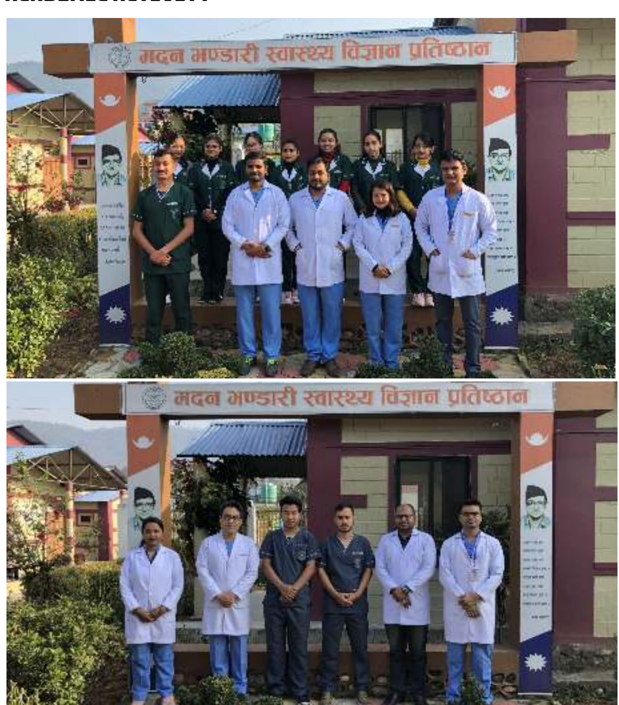
First batch students of BPH and BSc.MLT with their respective faculties